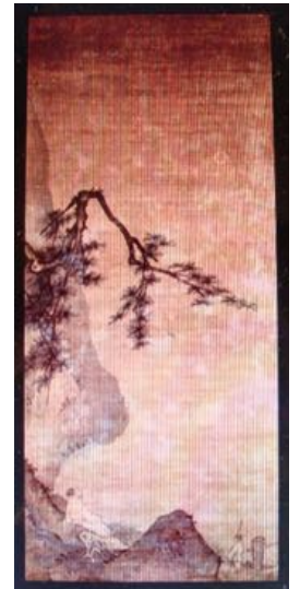
By Ma Yuan

Song Dynasty (960-1279) was an era of highest development in Chinese landscape painting. There were a variety of approaches, but the lyrical style was the most noted with the emergence of Ma Yuan whose landscape forms were reduced to close up, detailed rocks and trees. These primary forms were often located in the bottom left corner of the paper, a startling and compelling compositional device. The background hills were indistinct with grey mist, and large areas of space were sometimes left empty and unpainted. This gives a feeling of profound quiet and serenity that I appreciate. The approach reflects the influence of Zen Buddhism and painting nature at this time became more intuitive, spontaneous and simplified.*