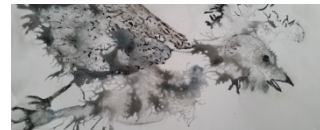
"BABY ROOSTER WATCHING"