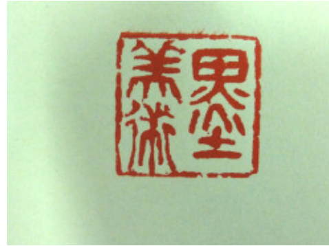
PSSA CHOP IMPRINT