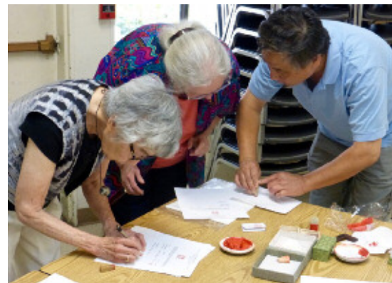
Signing the Document Signature Page