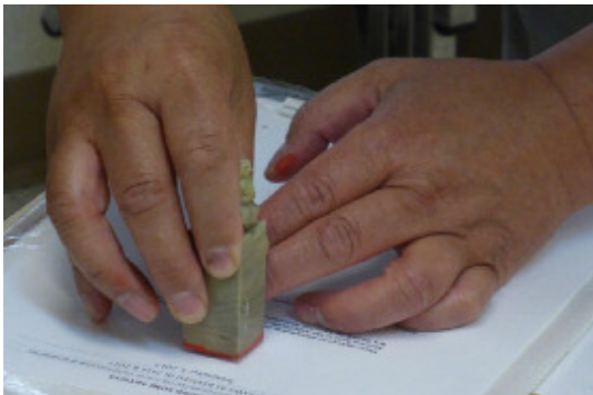
Yuming imprinting Bylaws page