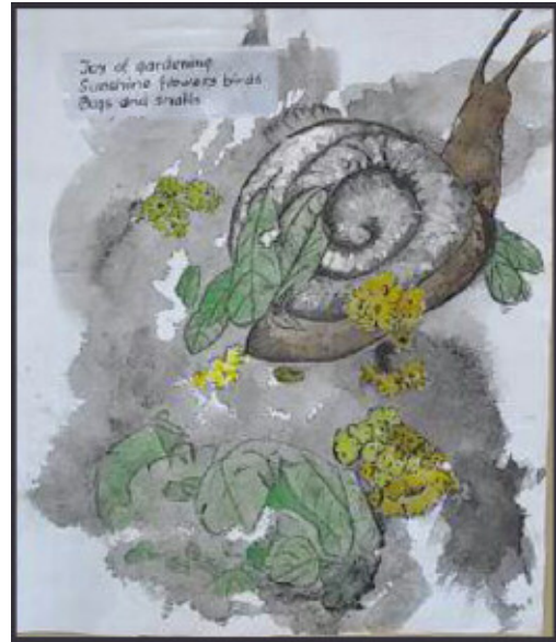
Joy of Gardening