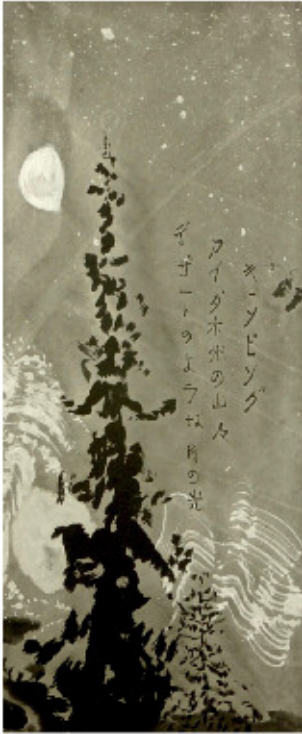
Camping in Idaho camping in the mountains of Idaho moonlight for dessert.

On September 12th we shared new work and introduced Peerless Watercolors and Pentel Water Brushes. Here are some of the haiga we made: