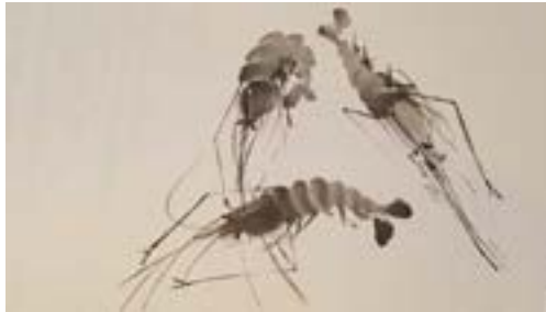
Reni's illustrative Shrimps